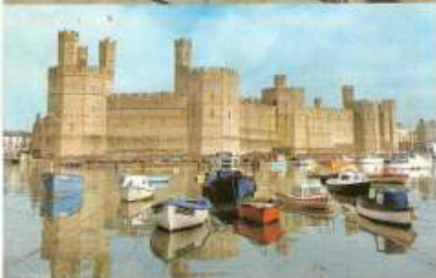
Clockwise from left: new attractions at Cardiff Bay; bookstores galore at Hay-on-Wye; the forbidding peaks and verdant valleys of Snowdonia; Caernarfon Castle